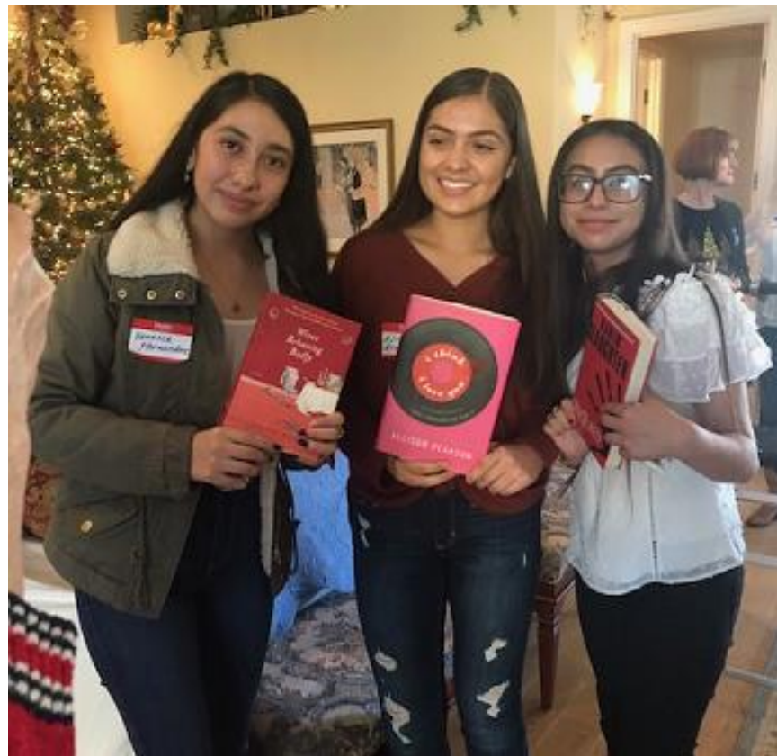
And one of the best parts of the day is the “passing of the gift books” – round and round (top) until you can claim your own (bottom)