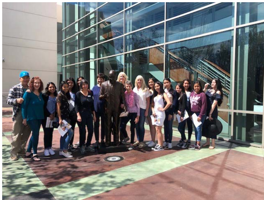
At the Gemological Institute of America