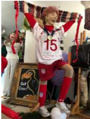
Final Megan Rapinoe Scarecrow

(inside Rolling Hills neighborhood) Fallbrook, California 92028