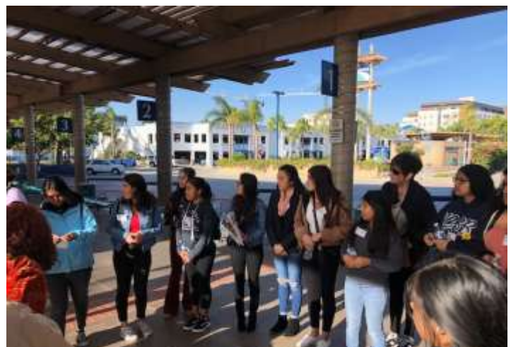
Waiting for the train