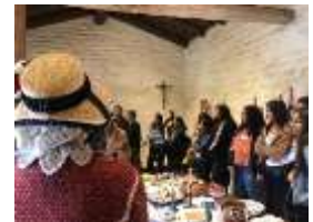
A beautiful home and typical table setting 1821-70s