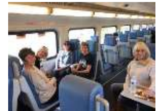
Riding the rails