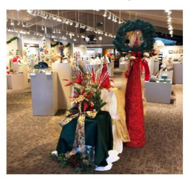
Downtown is our town - shop til you drop. Support our local merchants.