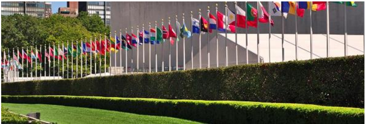
Flags flying at the United Nations

Our values: Nonpartisan, fact-based, integrity, inclusion, and intersectionality.