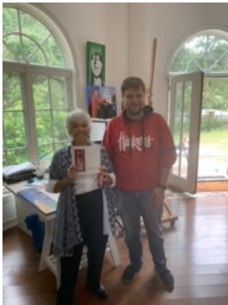
Photo with students who prepared our wonderful lunch