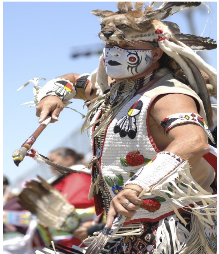
Pechanga Pow Wow

From the tip of South America to the Arctic, Native Americans developed scores of innovations—from kayaks, protective goggles and baby bottles to birth control, genetically modified food crops and analgesic medications—that enabled them to survive and flourish wherever they lived.