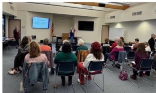
Members listening to the Public Policy Presentation