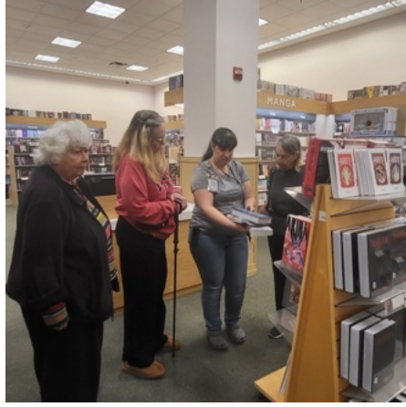
AAUW members learning about Manga.