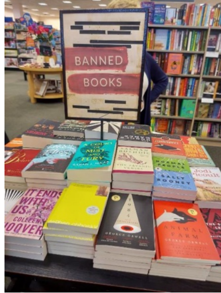
Barnes and Noble Banned Books Display--Just a Sampling