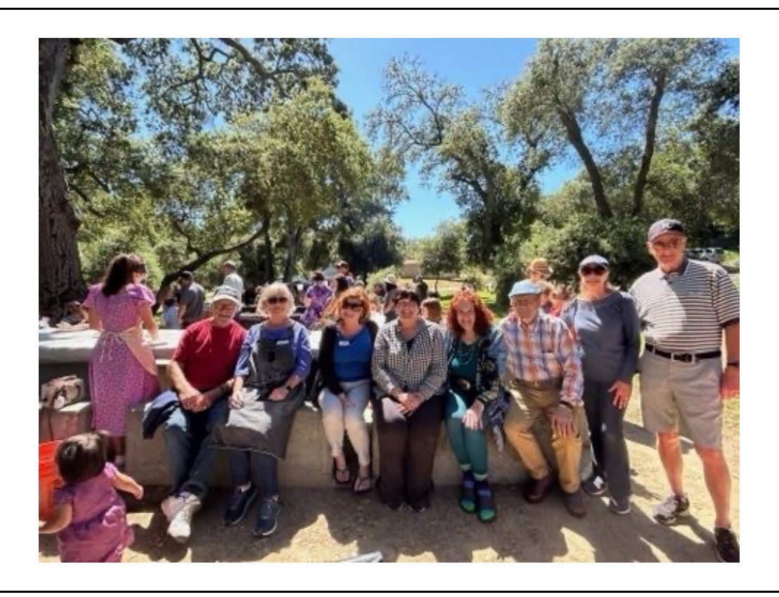
More AAUW Volunteers